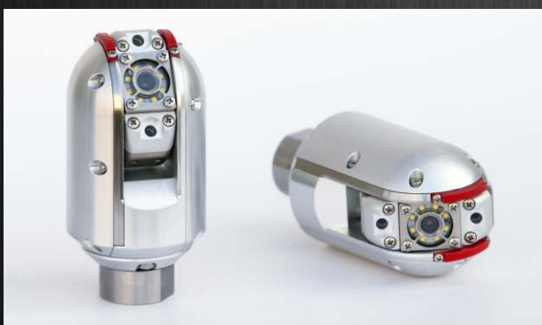
Option: Rotary camera head

This version of the portable colour CCTV camera system is intended for inspection of house sewerage including connections in the range of DN 50 - 300. The camera is pushed into the pipeline manually using a reinforced push-rod. Pely cases proof against water splashing are available in three versions - with USB output, SD memory card or PC. Another option is the compact ReBoss USB with or without integrated battery. The camera head with sapphire cover glass has a "Rolmatik - artificial leveling" system. The winch is equipped with an integrated brake and electronics, e.g. for measuring the length of the unwinded push-rod.